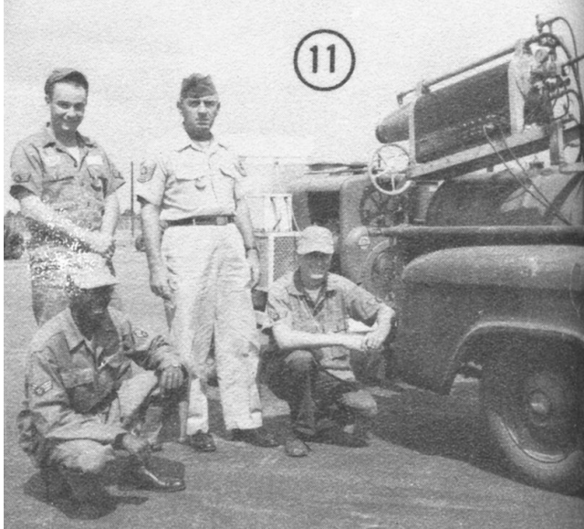
Ready to exterminate mosquitos